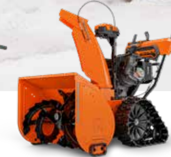
PLATINUM 28 SHO RAPIDTRAK®