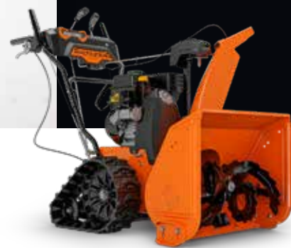
COMPACT 24 RAPIDTRAK