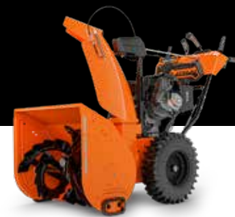
PLATINUM 24 SHO