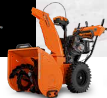
PLATINUM 24 SHO EFI GREAT LAKES EDITION™