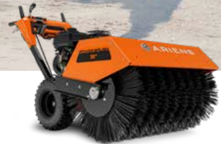
HYDRO POWER BRUSH 36