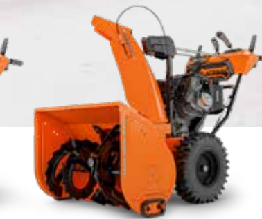
PLATINUM 30 SHO