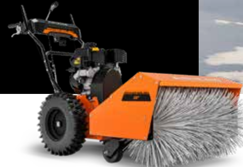
POWER BRUSH 28