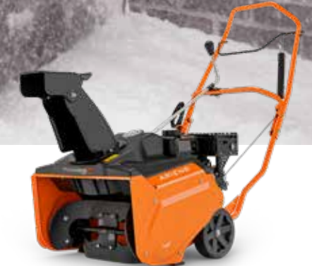
PROFESSIONAL 21 SSRC