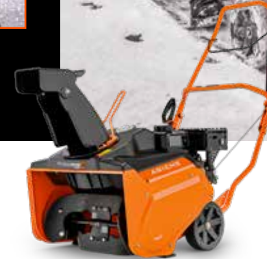
PROFESSIONAL 21 SSR