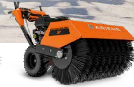
POWER BRUSH 36